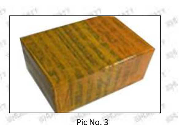
International express packaging: Wrapped with yellow tape after wrapping black protective film

Pic No. 2 Domestic express packaging: Wrapped with Transparent tape